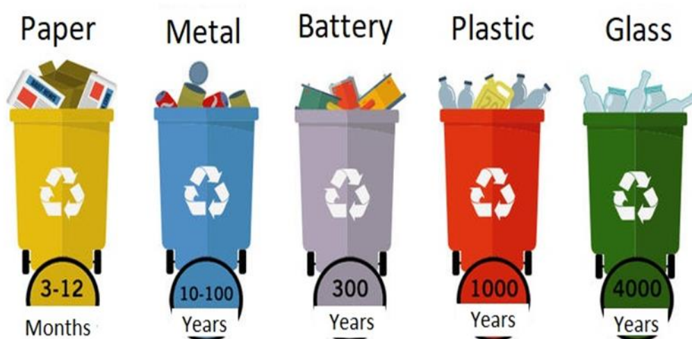
Figure 2. Duration of Some Waste Materials without Decomposition in Nature

Solid wastes remain in nature for a long time without deterioration, as a result, they cause environmental pollution and may adversely affect human health. For example, when plastics, one of the solid wastes, are thrown away, they remain in nature for many years without rotting, rusting, dissolving and biologically deteriorating. Some plastics can remain intact in nature for even about 1000 years. Approximate time periods during which some waste materials can remain without being destroyed when thrown into the nature are shown in Figure 2.