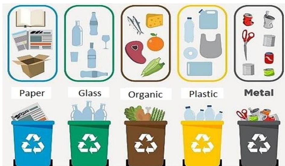
Figure 1. Some Recyclable Materials

One of the most important factors of environmental problems in the world is the problem of solid waste and garbage. It has emerged as an understanding that has been emphasized in recent decades that recycling activities are needed to solve the solid waste and garbage problem. The concepts of garbage and waste are often confused by individuals. Before informing about the concept of recycling, the concepts of garbage and waste should be clearly defined. Garbage; it can be defined as used waste materials that are useless after being used, are not expected to provide any benefit, and have no economic value. Waste, on the other hand, refers to substances that can be recycled and have an economic value after use. In fact, it can be said that the most distinctive feature that distinguishes the concept of waste and garbage is whether there is a possibility of recycling after use. The most important way to generate waste and reduce resource consumption is recycling and reuse. Wastes that will occur after production and consumption can be re-evaluated. Recycling is the process of converting the wastes that can be reused into raw materials or by-products by undergoing various processes and added to the production again. Due to recycling, wastes are separated from the garbage and included in the reproduction process using appropriate methods and can be used as secondary raw materials. Some of the materials that can be recycled are shown in Figure 1.