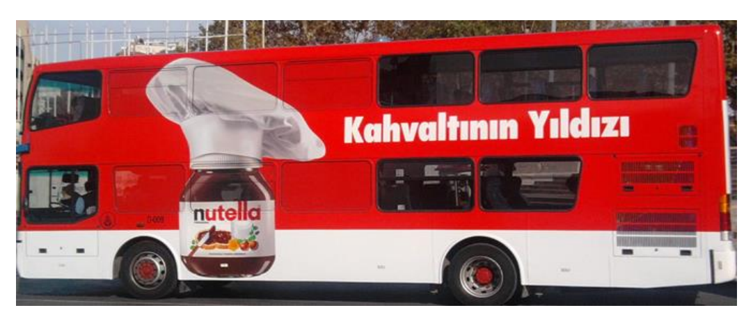
Figure 7. Examples of Nutella

Evaluation: It has a simple design choice. The use of the company's corporate red – white color in a layered structure has facilitated visual perception. A simple composition is preferred, so that the slogan and the visual structure can be perceived as comfortable.