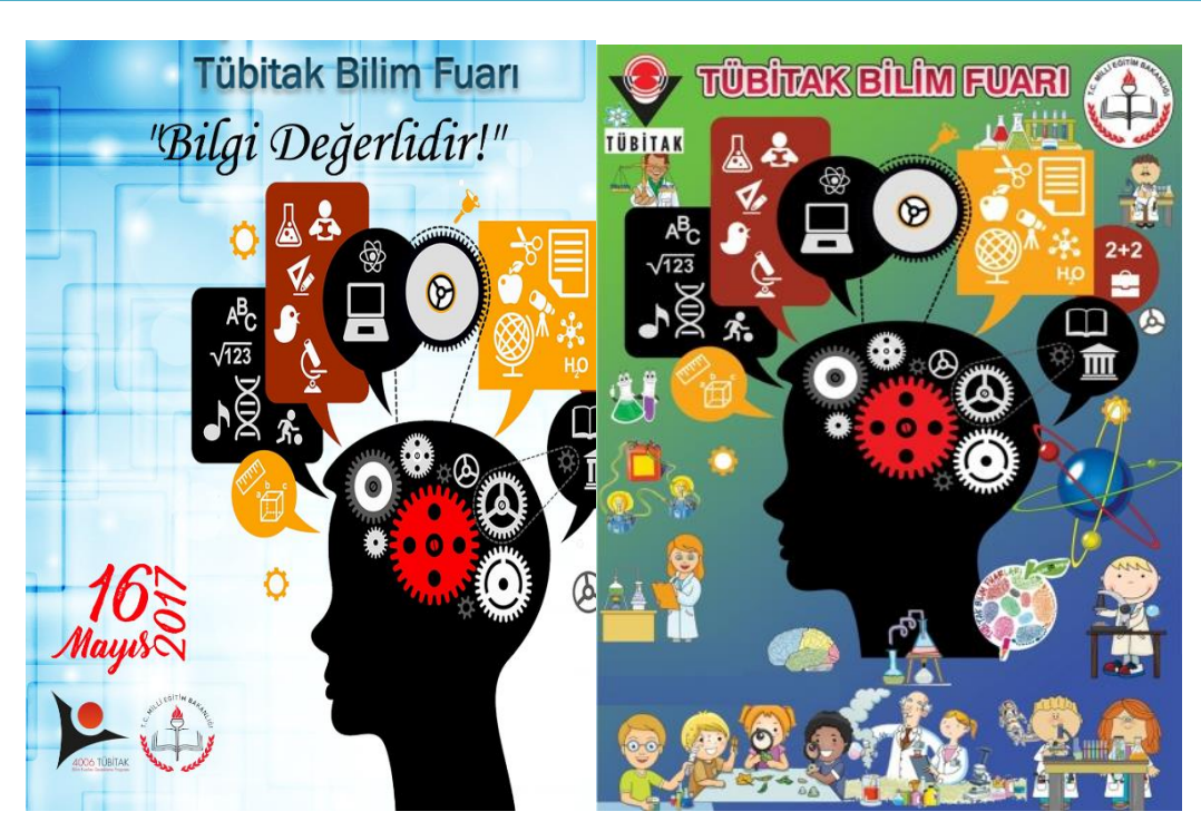
Figure 2. Examples of coloring in graphic design