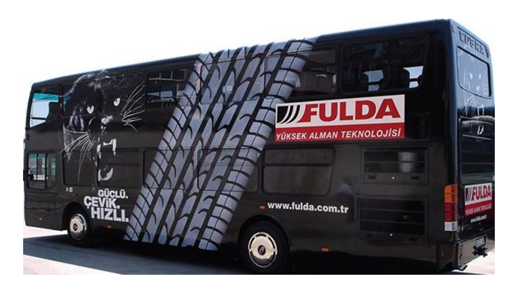
Figure 9. Examples of Fulda

Evaluation: She has a very successful design structure in terms of visual hierarchical preferences of design elements (color, size and composition). The success in the hierarchical regulation has been a successful result in terms of visual perception.