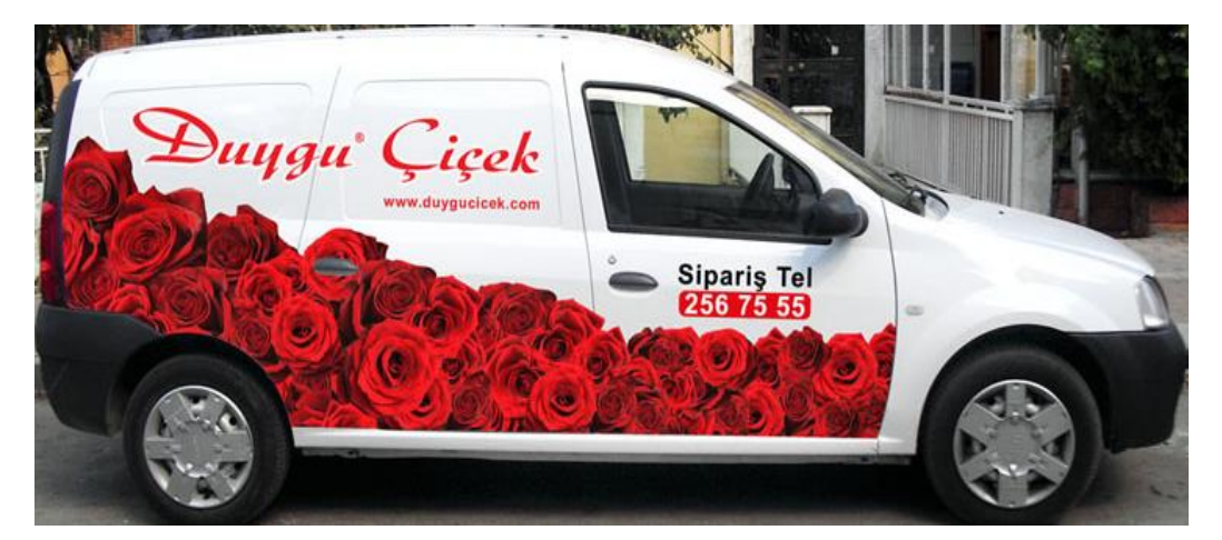
Figure 4. Examples of Duygu Çiçek