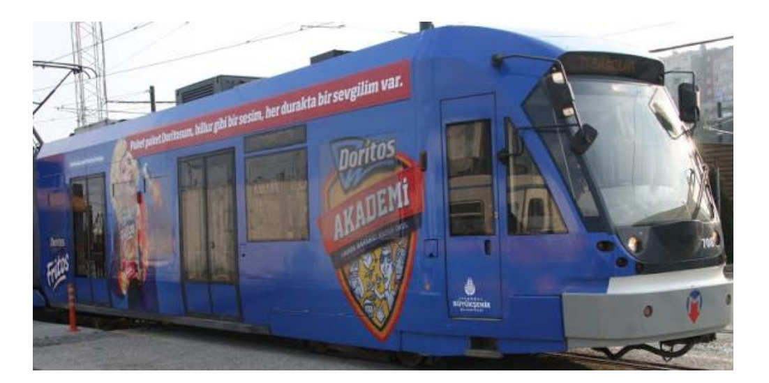
Figure 8. Examples of Doritos