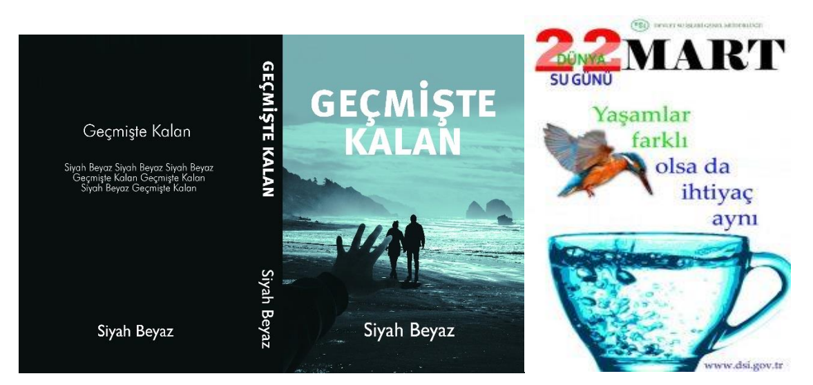
Figure 3. Examples of Positioning in Graphic Design