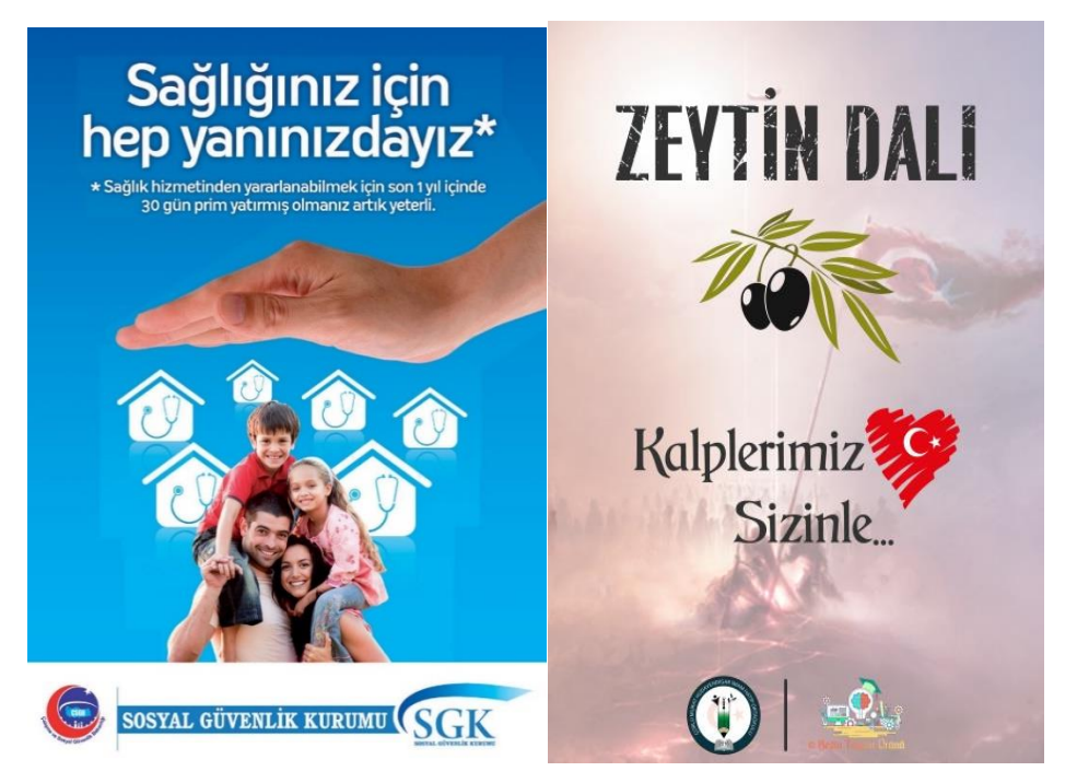
Figure 1. Examples of Sizing in Graphic Design