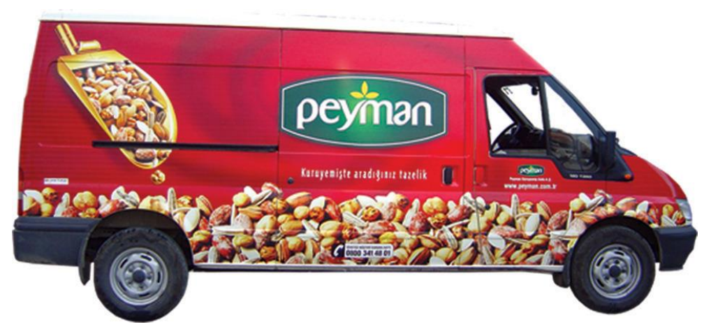
Figure 11. Examples of Peyman

Evaluation: The images are hierarchically at the forefront. The company logo is in the background with a smaller size than it should be. Typographic elements caused a failing structure in terms of visual perception with its white color and small points.