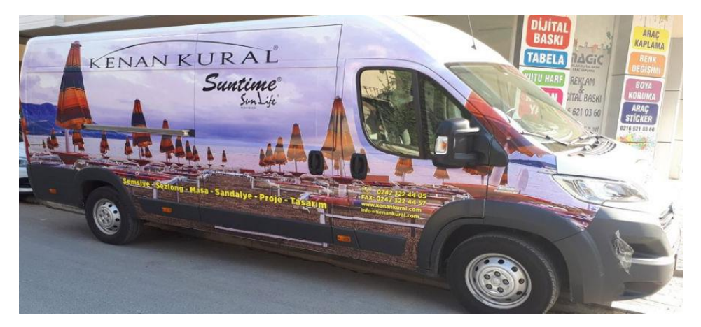
Figure 10. Examples of Kenan Kural