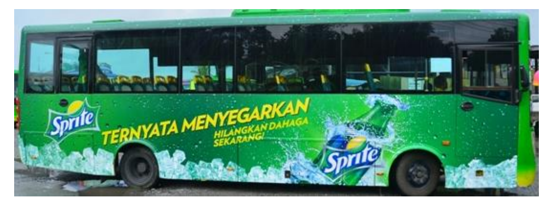
Figure 12. Examples of Sprite

Creating large blank spaces in a design or preferring large dimensions can facilitate detection. What is important here is not just size or space. The important thing is to analyze the elements in the design very well and to make the compatibility structure with each other well. Differences in these design elements are determined by the designer's preference. When the standard design elements of an organization are prepared as draft works by different designers, only the dimensions and positioning of the design elements are observed. These differences also reveal the visual perception level differences of that design.